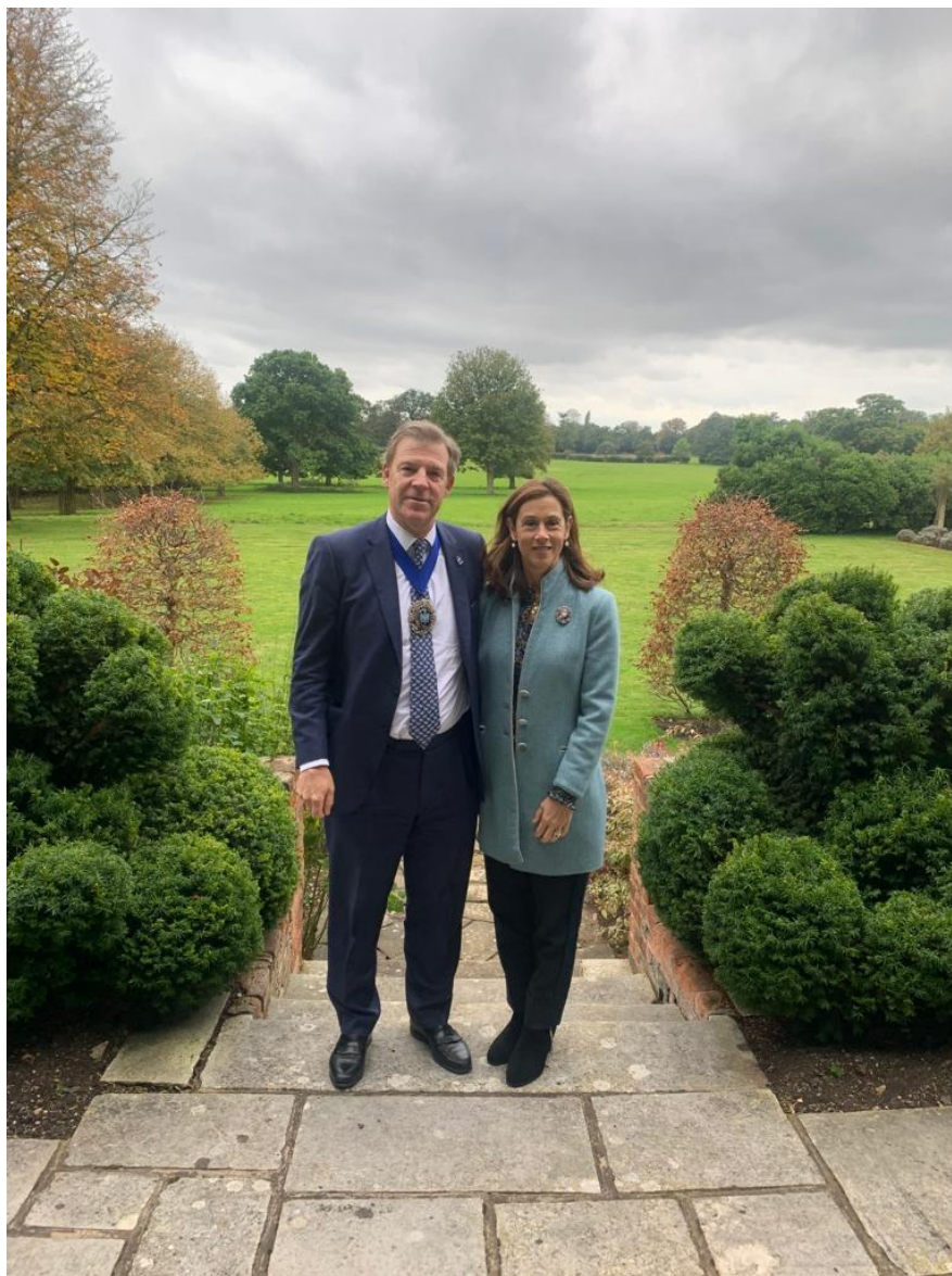
The Lord Mayor and Lady Mayoress at Dorneywood after visiting Burnham Beeches